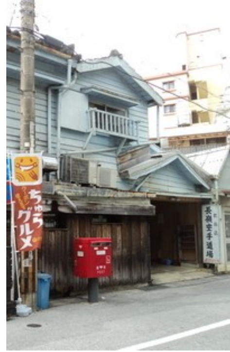
Illustration 1: Honbu Dojo in Okinawa