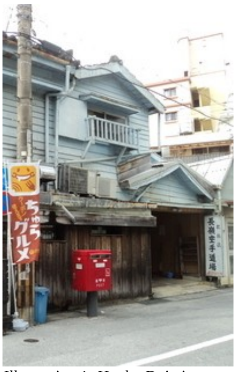
Illustration 1: Honbu Dojo in Okinawa